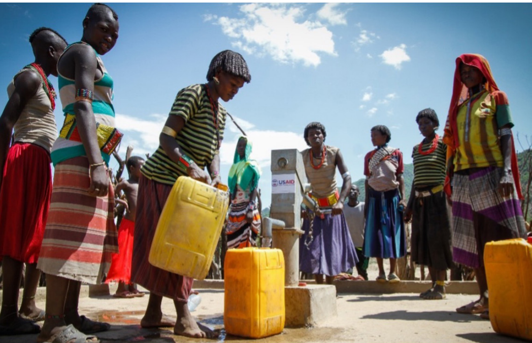
Bena tsemay woreda, duma kebele, community fetching and using ground water from the newly built water point at buluko.